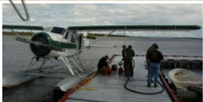
C-FCOO preparing for flight to Lodge