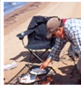
noon fish fry

The “average” brook trout taken on the Minipi is a staggering 5 - 5 1/2 pounds!