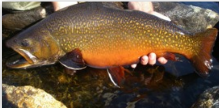
Magnificent, healthy brookies

We have 16 - 18 days per month with the chance of rain during June - September. Relative humidity is generally 78 - 83%. Prevailing winds westerly. Long days, an abundance of sunshine, June, July and August will normally have 174 - 206 sunshine hours per month. Quite often we will have the hottest temps east of Montreal.