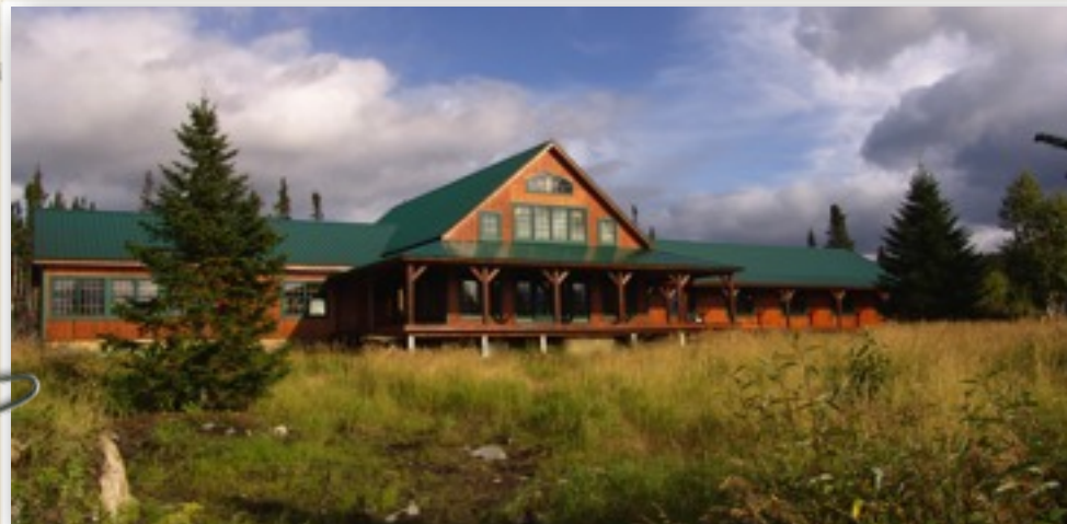
the Lodge at Anne Marie Lake