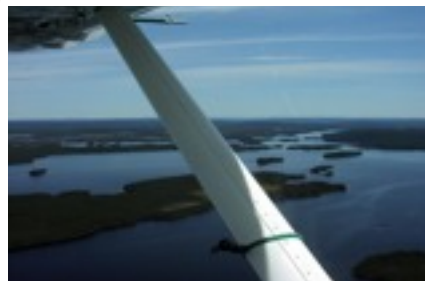
a land of countless lakes and rivers