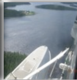
Exploring Minipi waters ...

FLY OUT ADVENTURE is FREE with bookings for August or September 2010.