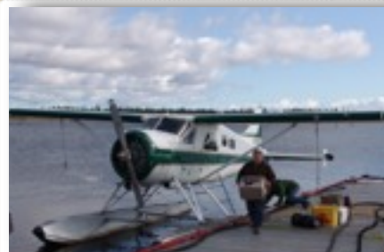
Often called “the workhorse of the north...”