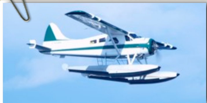
C-FC00 OPERATED BY MINIPI AVIATION LIMITED

With its powerful Pratt & Whitney 450-horsepower Wasp engine, extra wide doors for loading and unloading, and an oil reservoir that could be refilled even during flight, the Beaver had the power, durability and versatility the military needed. From 1949 - 1967, de Havilland built 1,657 Beavers - and the US Army bought 1,000 of them. Many were used during the Korean and Vietnam wars. Book now to experience this historic aircraft yourself as you fish some of the last still-undiscovered waters on the planet.