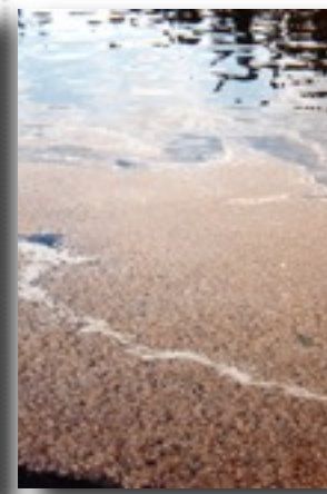
Remains of an abundant hatch.