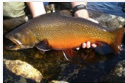
Little wonder the locals call them "Big Red"